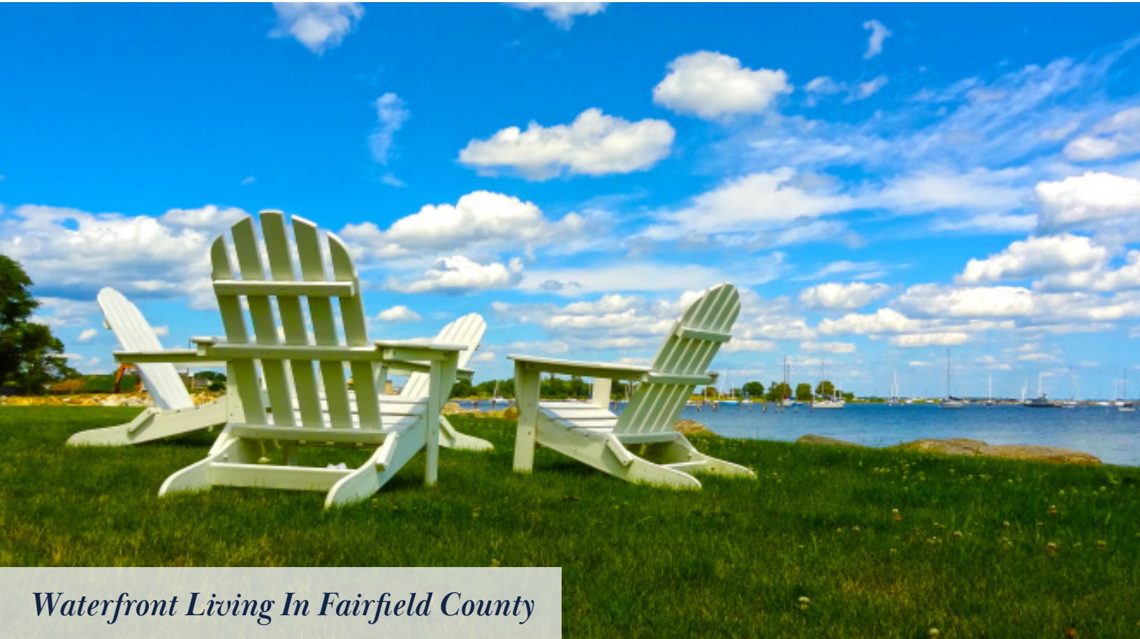
Waterfront Living In Fairfield County