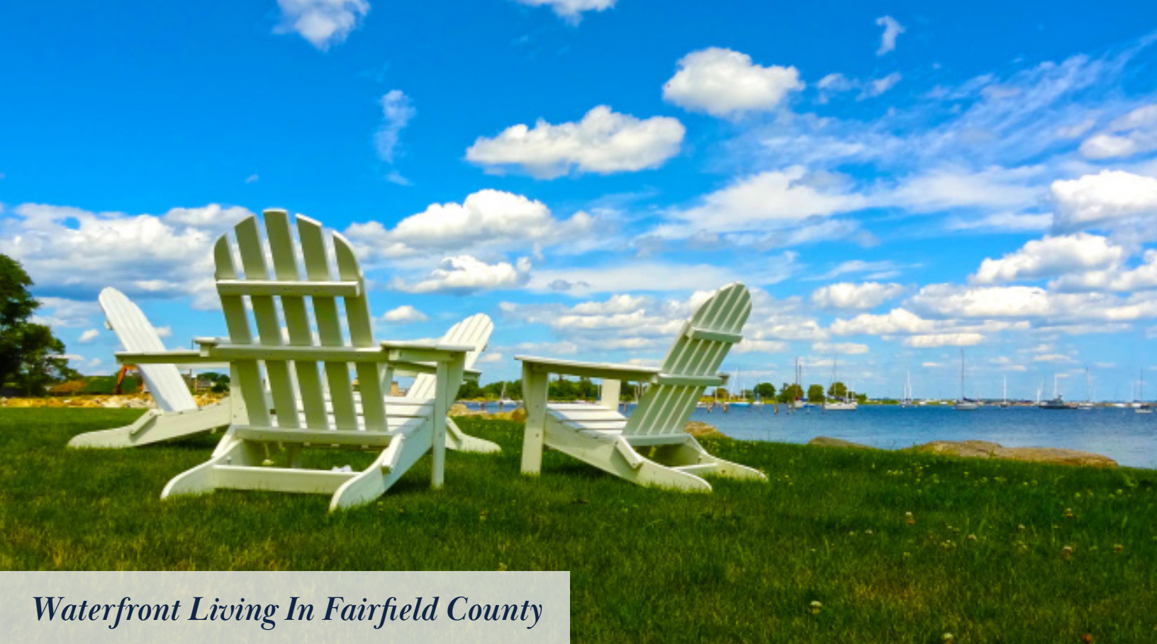
Waterfront Living In Fairfield County