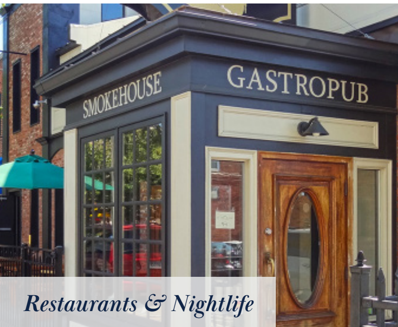
Restaurants & Nightlife