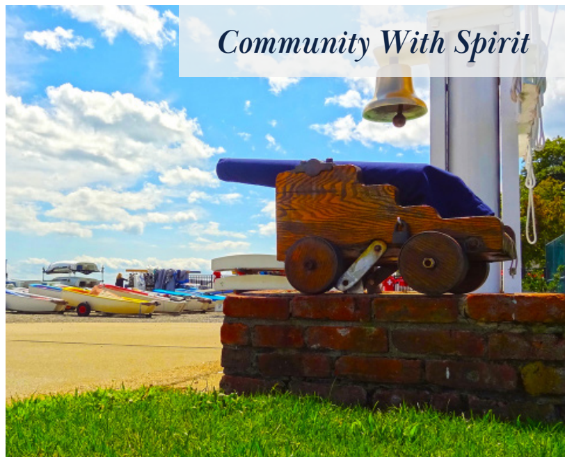
Community With Spirit